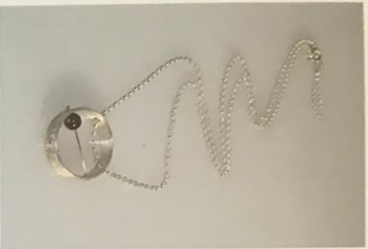
Clockwise from top left:

Chapin Diamond: Games: One Line : Sterling silver, 18k gold, polished diamond sphere; 2018